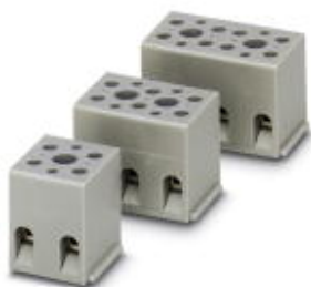
Device terminal block, for direct mounting, 6-pos.

Please be informed that the data shown in this PDF Document is generated from our Online Catalog. Please find the complete data in the user's documentation. Our General Terms of Use for Downloads are valid ( http://phoenixcontact.com/download )