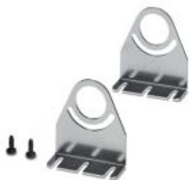
Mounting brackets, stainless, 2A (X5CrNi-18-10): Steel, for machine lights PLD M 260 .../D70, Swiveling range \pm 65^\circ

Please be informed that the data shown in this PDF Document is generated from our Online Catalog. Please find the complete data in the user's documentation. Our General Terms of Use for Downloads are valid ( http://phoenixcontact.com/download )