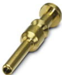
Crimp contact, turned, contact diameter: 3.6 mm, crimp range: 2.5 mm 2 ... 4 mm 2

Please be informed that the data shown in this PDF Document is generated from our Online Catalog. Please find the complete data in the user's documentation. Our General Terms of Use for Downloads are valid ( http://phoenixcontact.com/download )