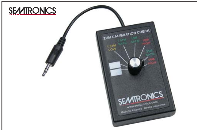
Figure 1. 62170 Limit Comparator

1. The purpose of the DUAL WIRE Limit Comparator Operator Calibration Check Resistor Box is to verify the calibration of the ZVM 62002(ZVM1002) and the 62030(SE900-1) by checking 4 operator conditions: FAIL LOW, PASS SAFE (low limit), PASS SAFE (high limit), and FAIL HIGH.